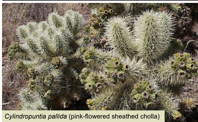
Cylindropuntia pallida (pink-flowered sheathed cholla)