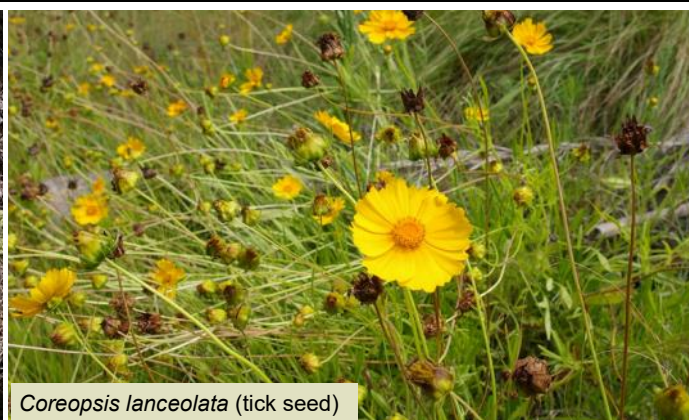
Coreopsis lanceolata (tick seed)