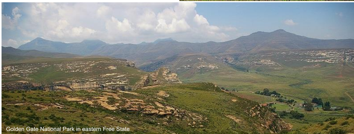
Golden Gate National Park in eastern Free State